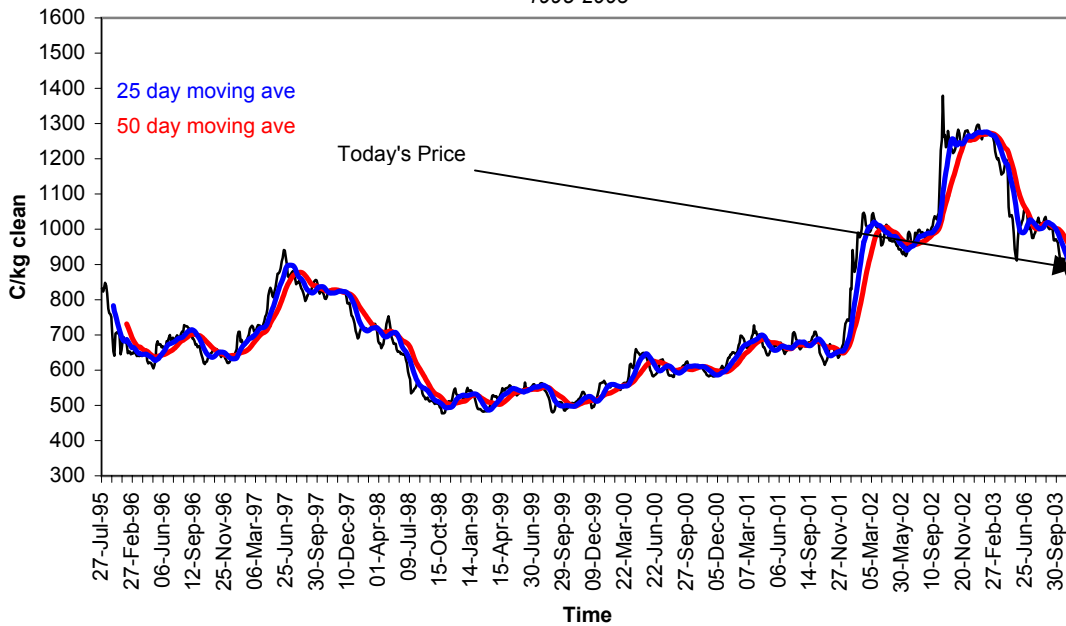
20 Micron -North 1995-2003