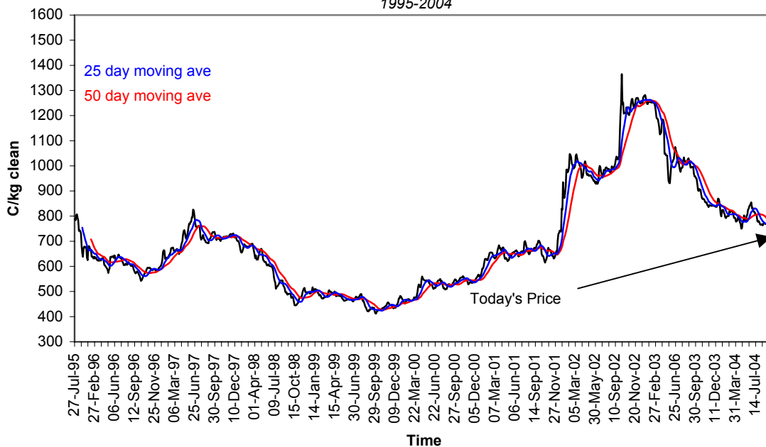
22 Micron -North 1995-2004