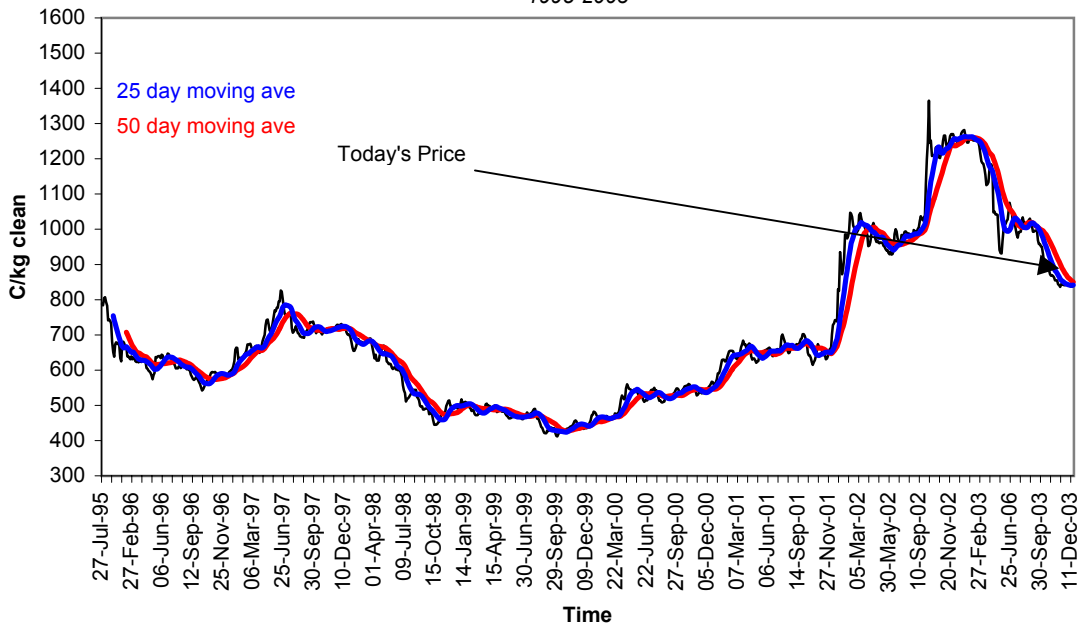
22 Micron -North 1995-2003