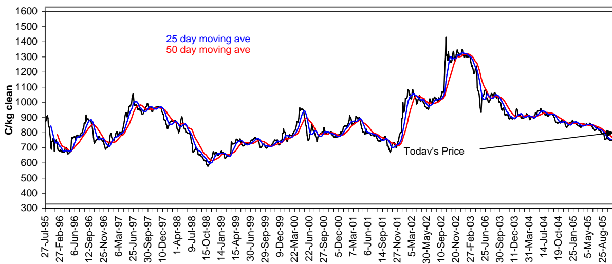
Micron Price Guide Movement 1995-2005