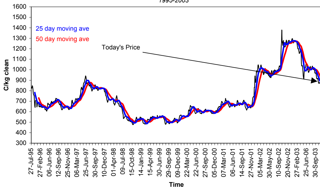
20 Micron -North 1995-2003