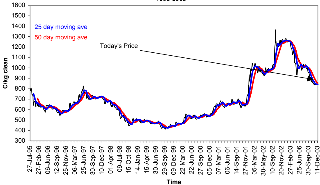
22 Micron -North 1995-2003