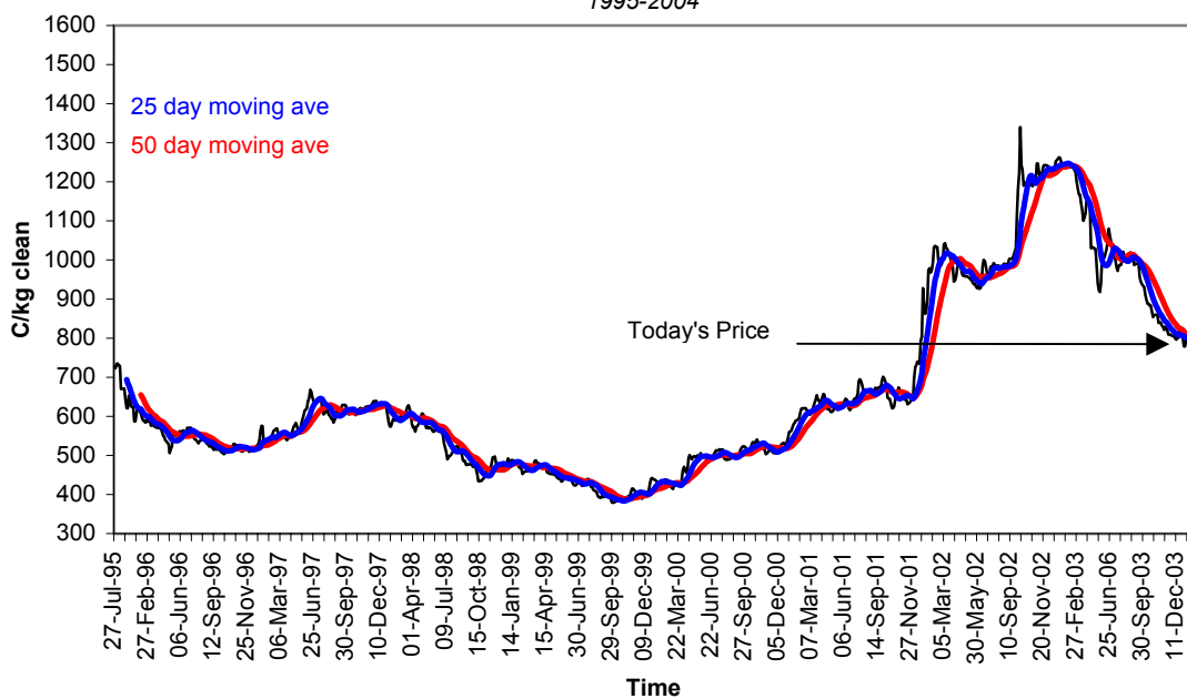
23 Micron -North 1995-2004