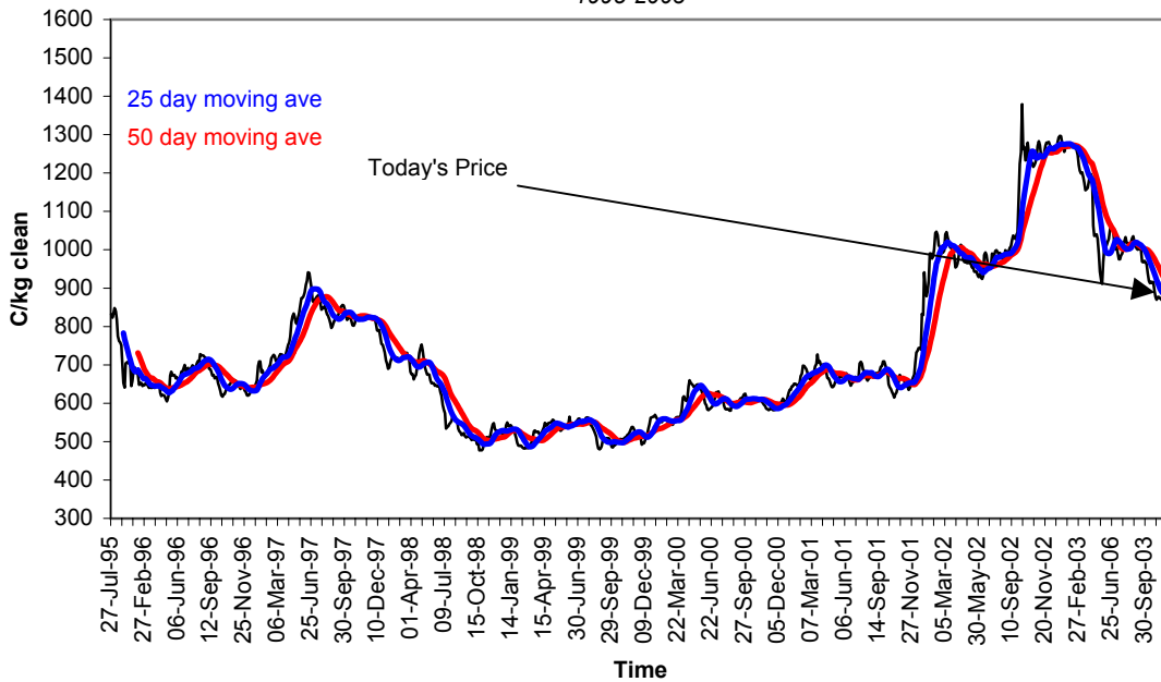
20 Micron -North 1995-2003