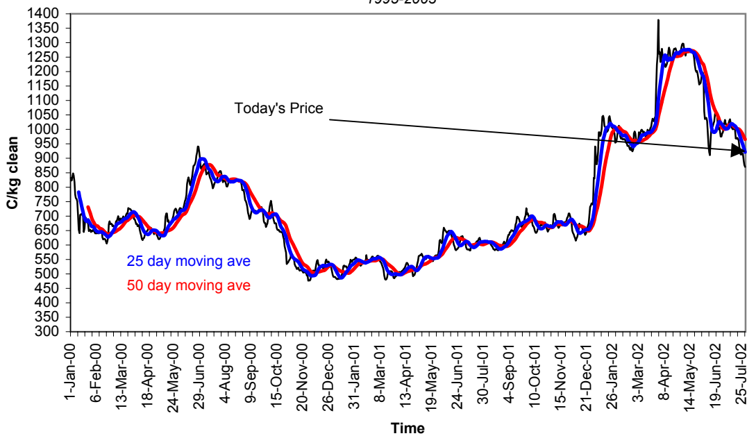
21 Micron -North 1995-2003