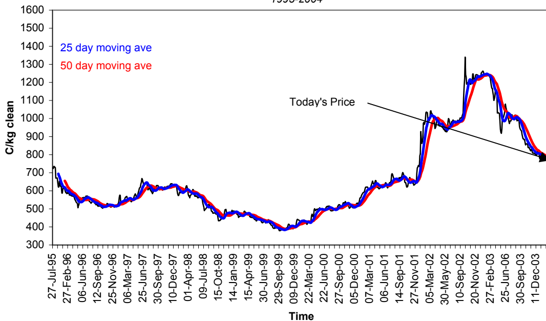
23 Micron -North 1995-2004