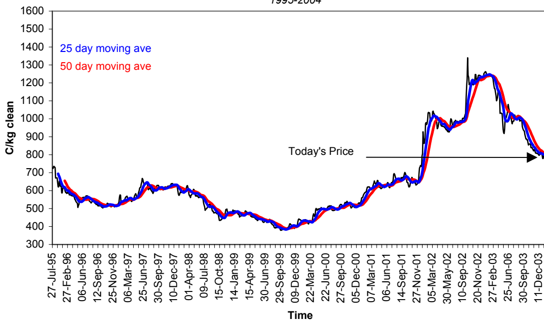
23 Micron -North 1995-2004