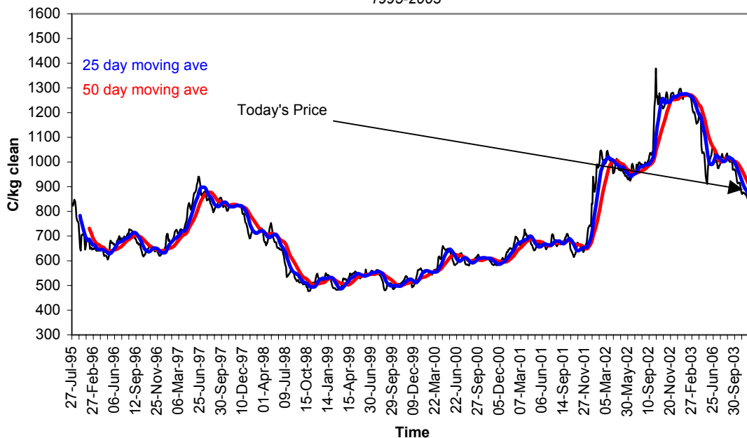
20 Micron -North 1995-2003